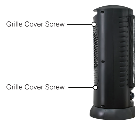
Grille Cover Screw

CLEANING: CAUTION-Before cleaning the heater be sure to disconnect power cord and allow the heater to cool completely. Clean the outside surface with a clean damp cloth. Do not use harsh chemical or abrasive cleaners. DO NOT IMMERSER THE HEATER IN WATER. Allow heater to dry completely before use. The heater comes with a washable filter located at the air inlet. When filter looks dirty, simply unscrew rear grille cover, remove filter from the heater and rinse with warm water. Be sure to allow the filter to dry completely before carefully placing it back into the heater. Re-install safety grille cover with screws. Do not operate this heater with safety grille removed.